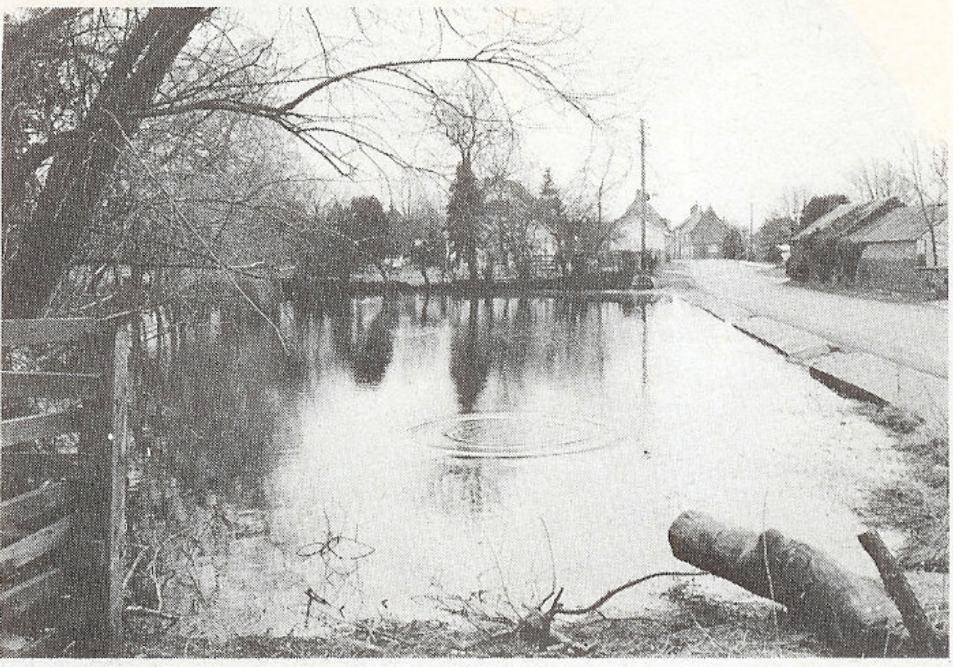
The village pond adds a picturesque touch to the Willoughby scene.

The former Vicarage, an elegant Regency building of sand-coloured brick, has now been superseded by a smaller and more modern dwelling. The village is currently without its own Vicar and is awaiting the appointment of a new one.