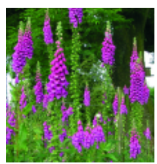
foxgloves - R. Burkmar

Ground ivy (G)(N) Dame's violet Bluebell (G)(N) Comfrey (N) Yellow archangel Honeysuckle (N) Great wood-rush (N) Solomon's seal Wood vetch(N) Dog violet (N) Snowdrop Green hellebore (E) Wood forget-me-not (N) Ivy(E)(G)(N)