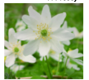
Native wood anemones indicate that a wood is very old