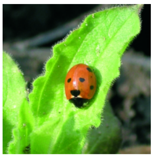
ladybird - S. Tatman

If your patch is covered in lots of weeds, there are some plants you can use to get rid of them. For example, the roots of marigolds give off a chemical which poisons ground elder and bindweed.