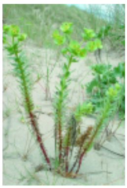
portland spurge - N. Wyatt

The following pages should help you to garden successfully in these conditions.