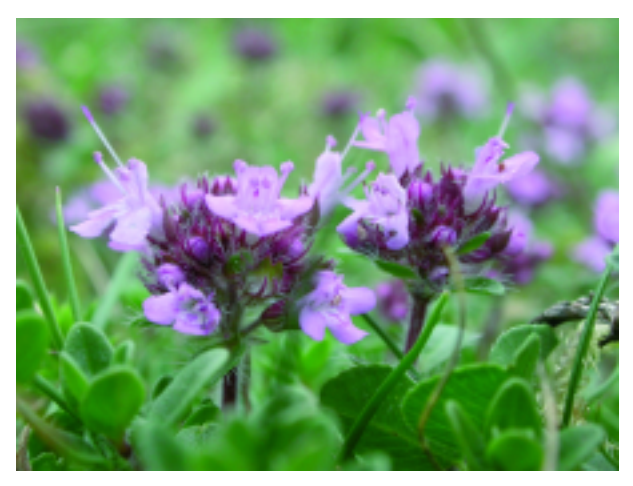
common thyme

For more information go to www.wildlifetrusts.org