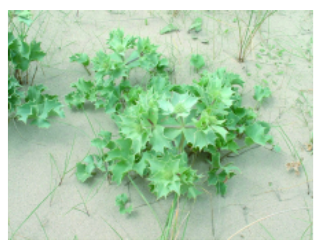
sea holly - N. Wyatt